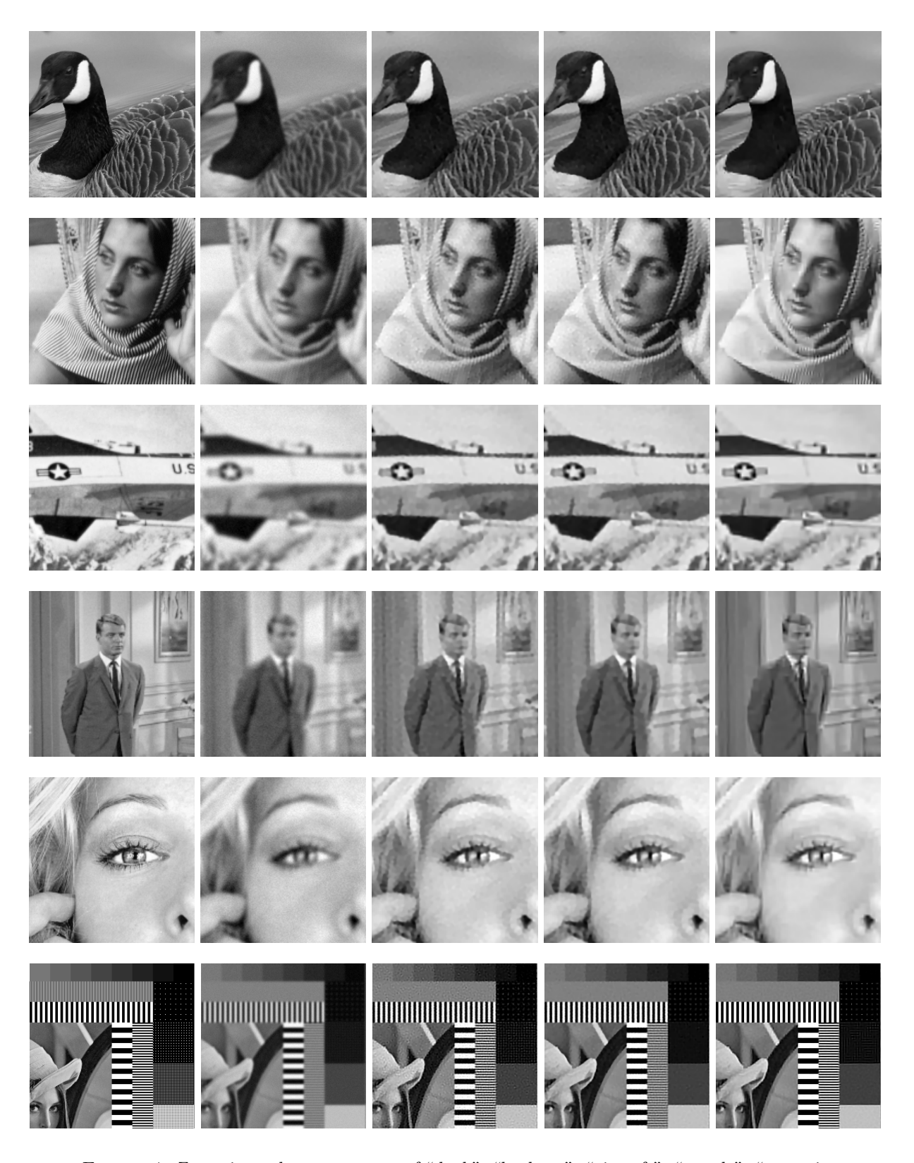
FIGURE 4. Zoom-in to the texture part of "duck", "barbara", "aircraft", "couple", "portrait II" and "lena". Image from left to right are: original image, observed image, results of the balanced approach, results of the analysis based approach and results of the PD method.