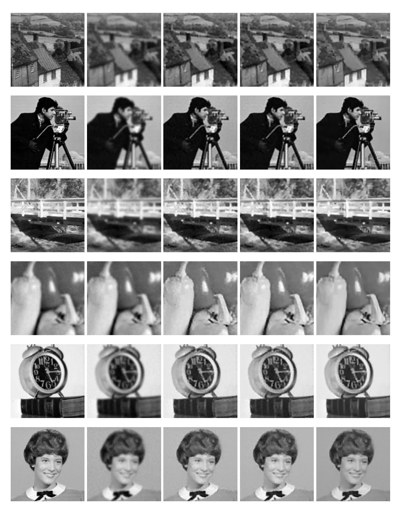
FIGURE 3. Zoom-in to the texture part of "downhill", "cameraman", "bridge", "pepper", "clock", and "portrait I". Image from left to right are: original image, observed image, results of the balanced approach, results of the analysis based approach and results of the PD method.